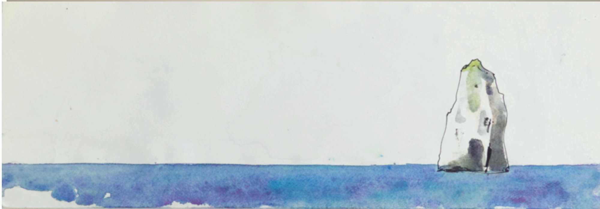
3. Pavlos Habidis - Ortholithos 2013 watercolor