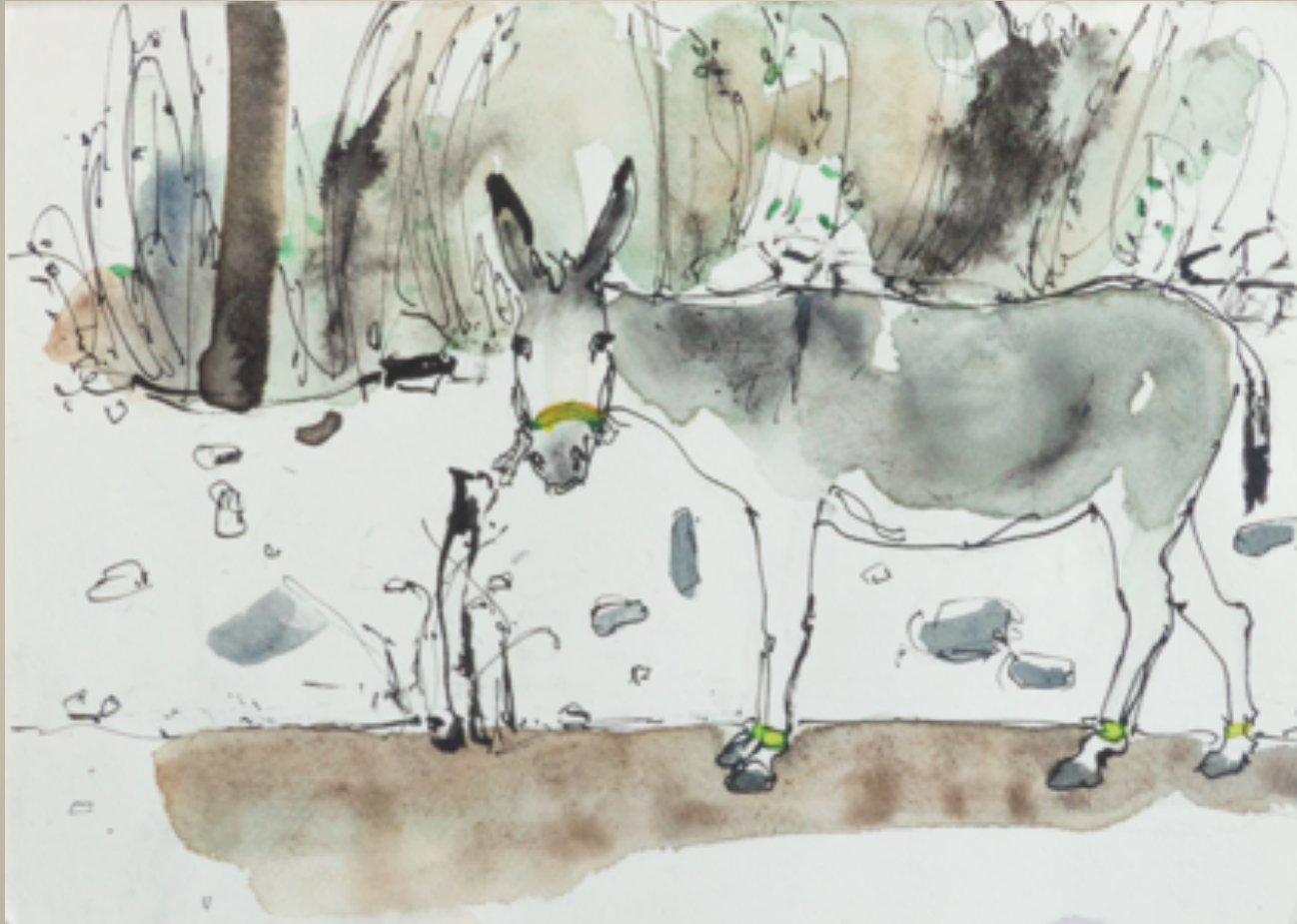
9. Pavlos Habidis - The last donkey in Paxos 2013 watercolor