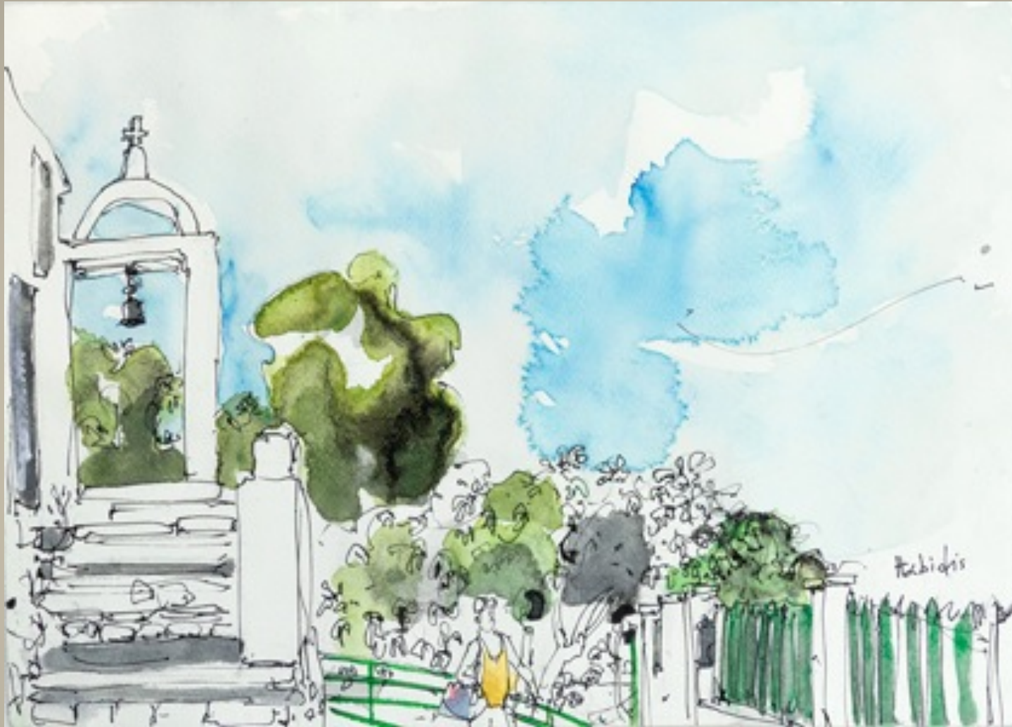
8. Pavlos Habidis - Agios Ioannis church, Lakka 2013 watercolor