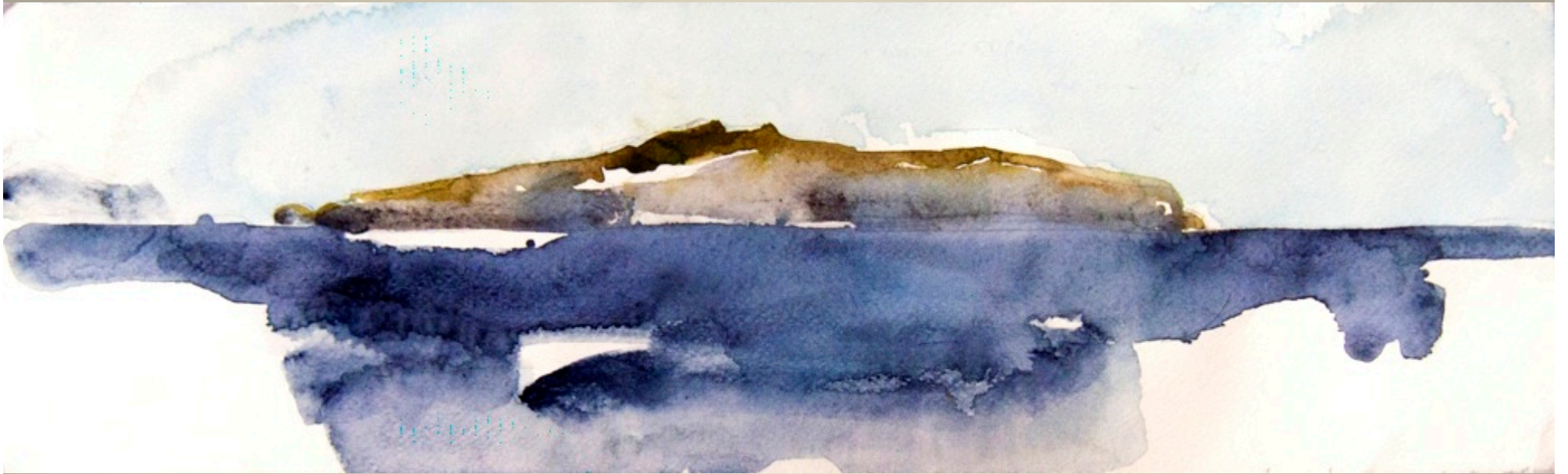
2. Pavlos Habidis - Antipaxos Canal 2012 watercolor