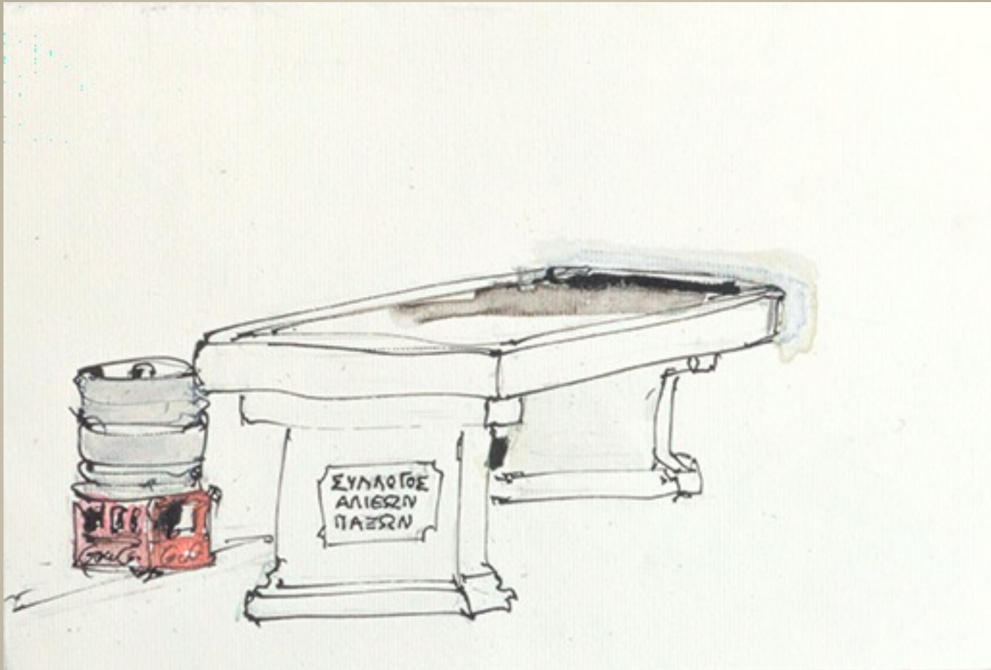
12. Pavlos Habidis - Fish mongers table, Gaios square 2013 watercolor