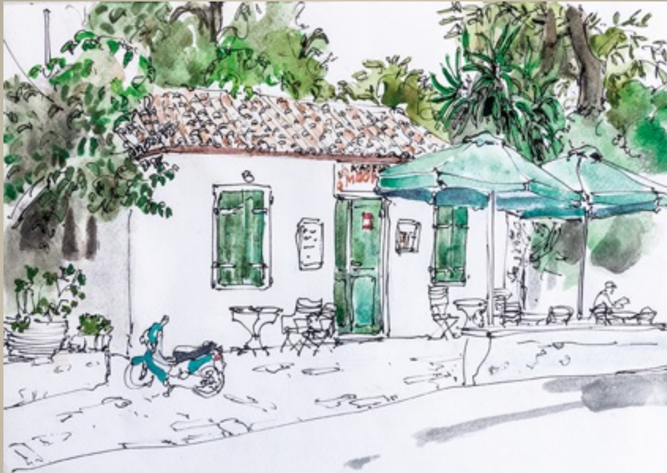
4. Pavlos Habidis - Bournaos traditional coffee shop 2013 watercolor