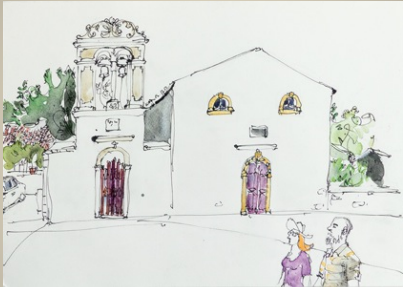
7. Pavlos Habidis - Agioi Pantes, Makratika village 2013 watercolor