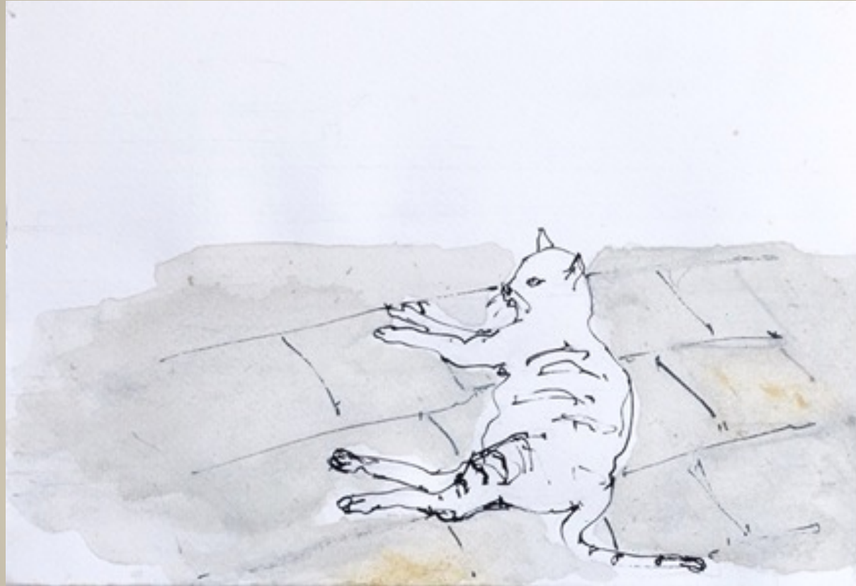
11. Pavlos Habidis - Stray cat 2013 watercolor