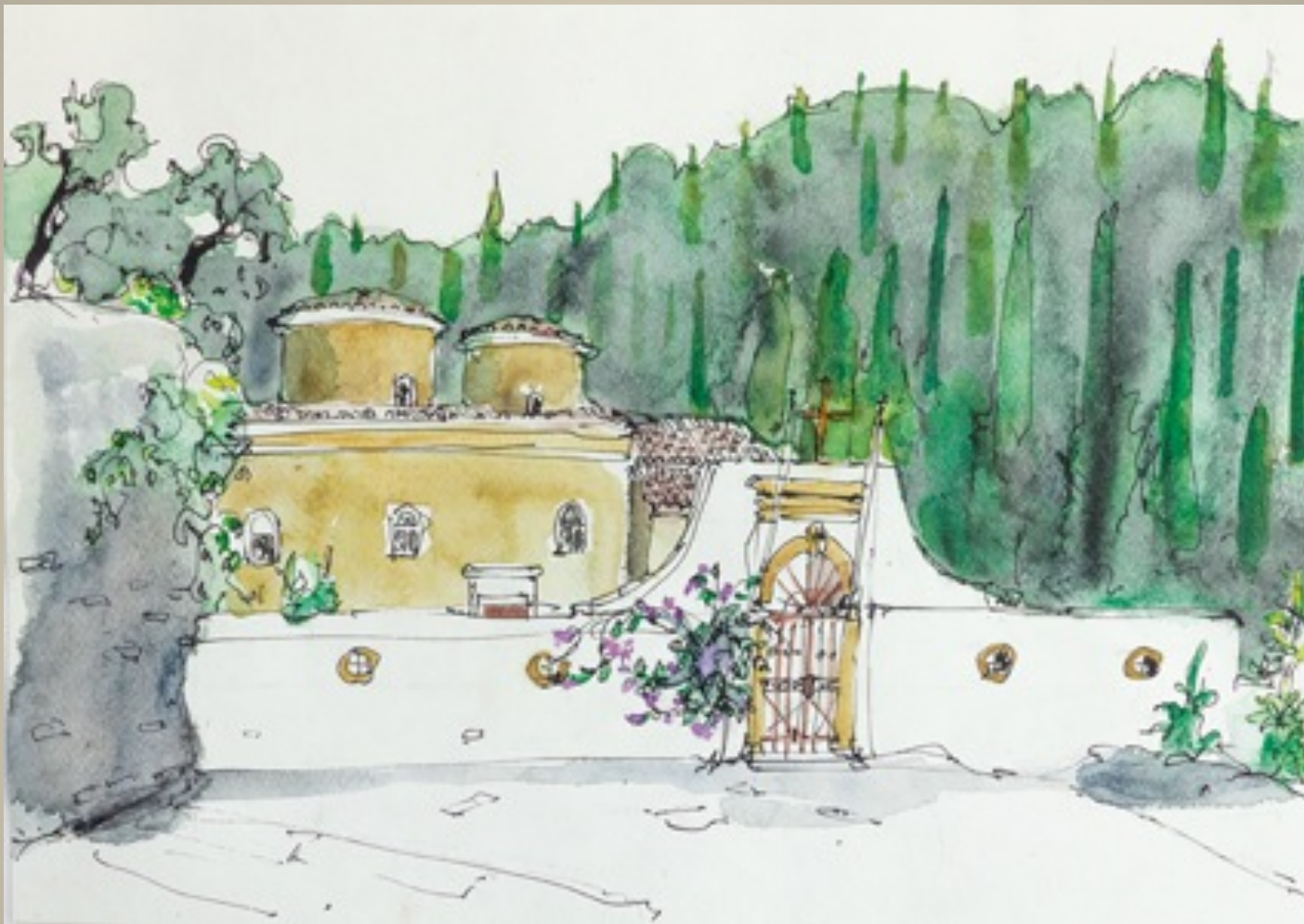
5. Pavlos Habidis - Ypapanti church, Vasilatika, Lakka 2013 watercolor