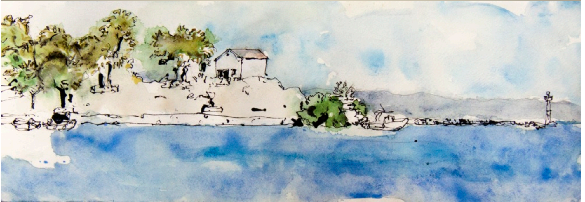
1. Pavlos Habidis - St Nicholas church, St Nicholas island 2012 watercolor