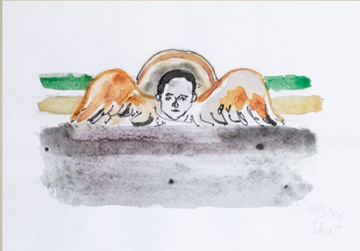
6. Pavlos Habidis - Seraphim 2013 watercolor