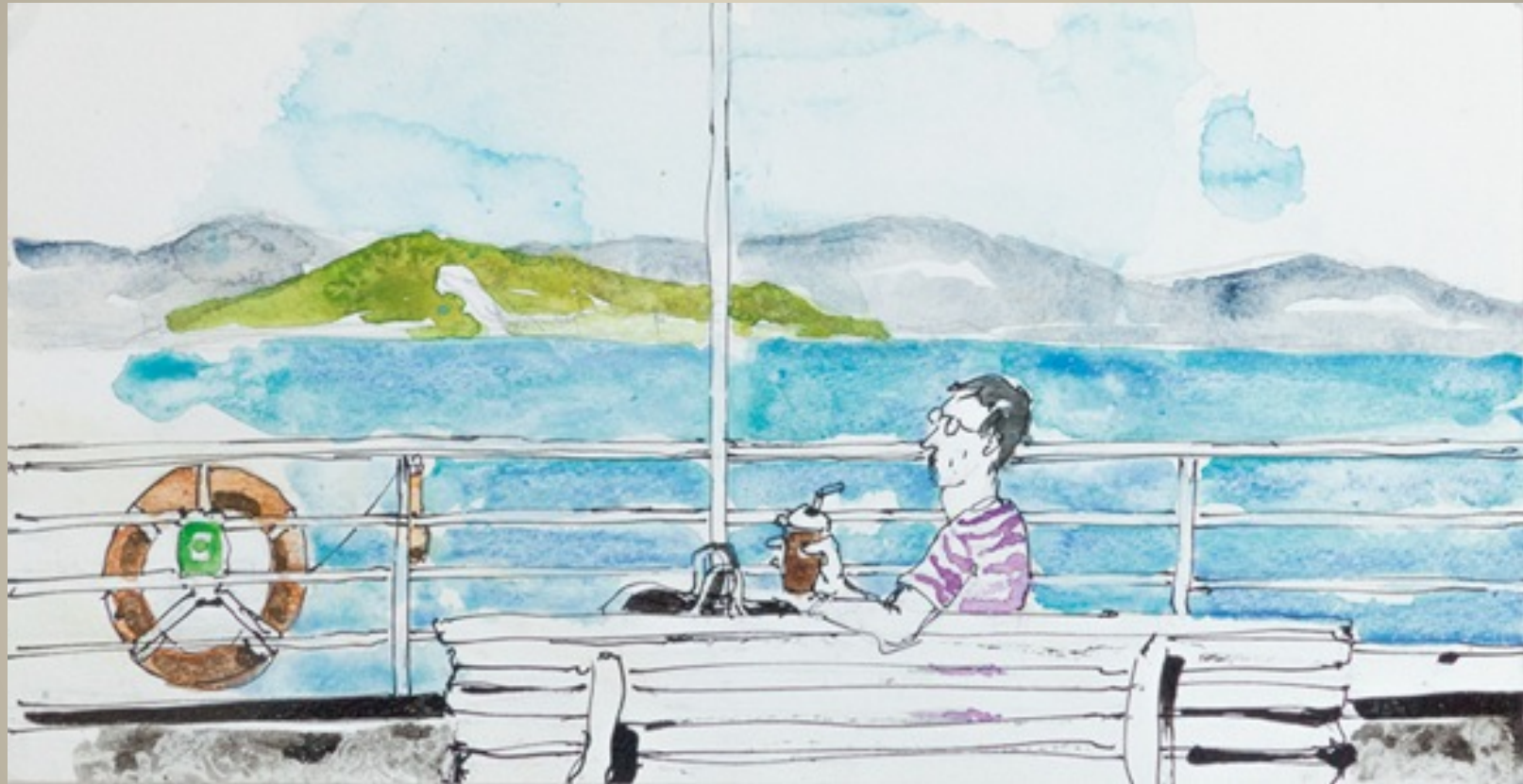
14. Pavlos Habidis - Leaving Paxos 2013 watercolor