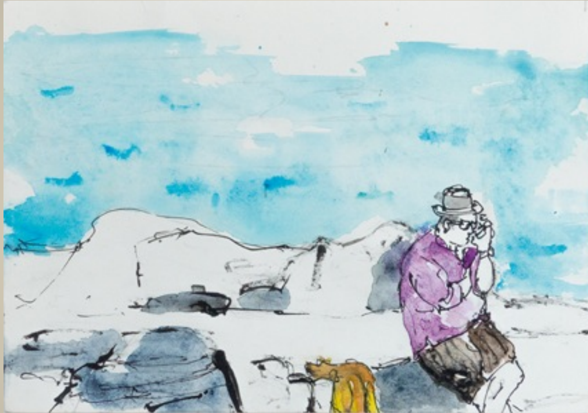
13. Pavlos Habidis - On the phone, Plakes 2013 watercolor